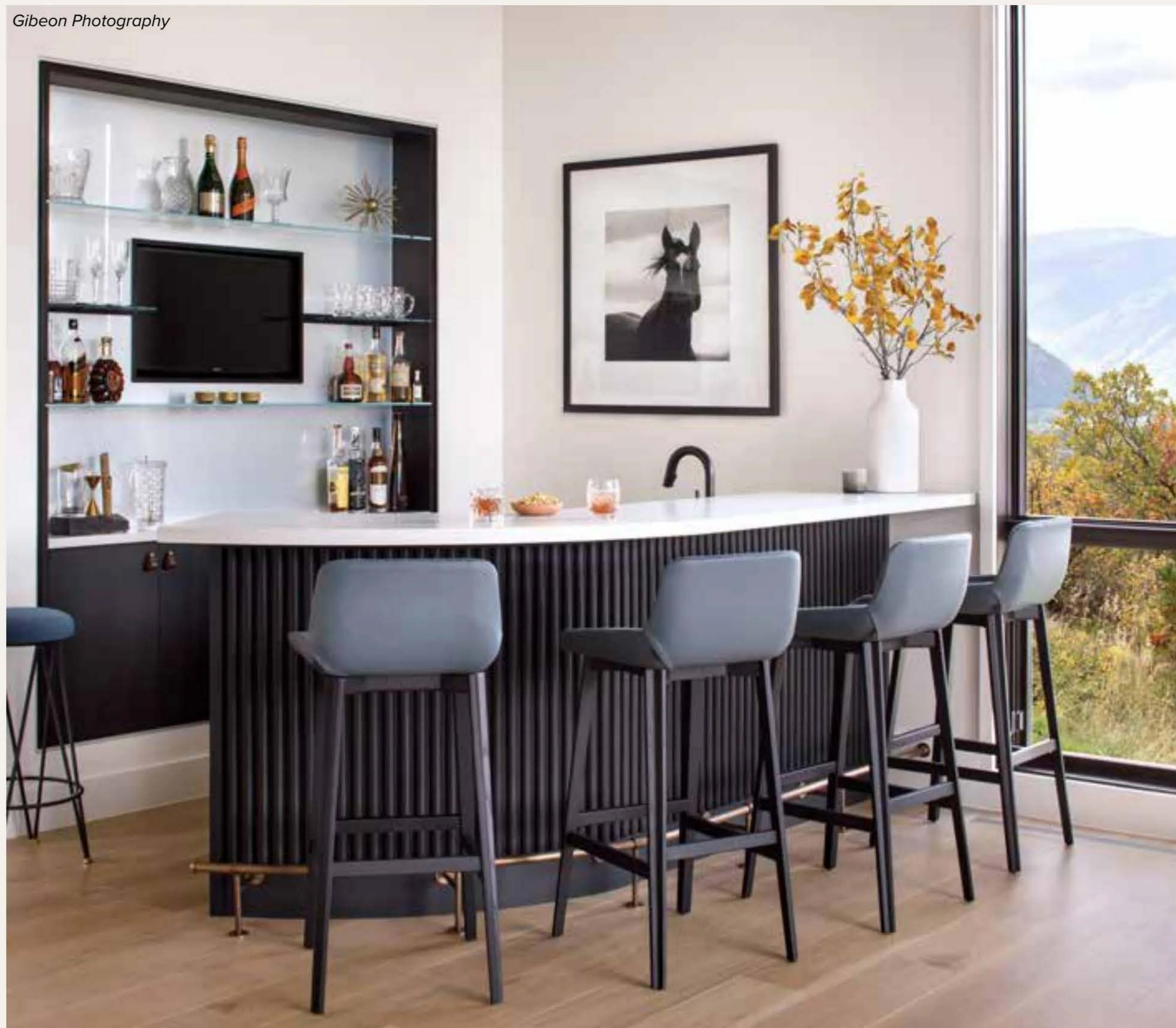
This Luxury Interior Design Firm Focuses on Holistic Connections to Your Surroundings